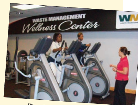
Waste Management Wellness Center