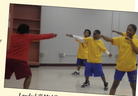
Lauderhill Middle School student exercise class